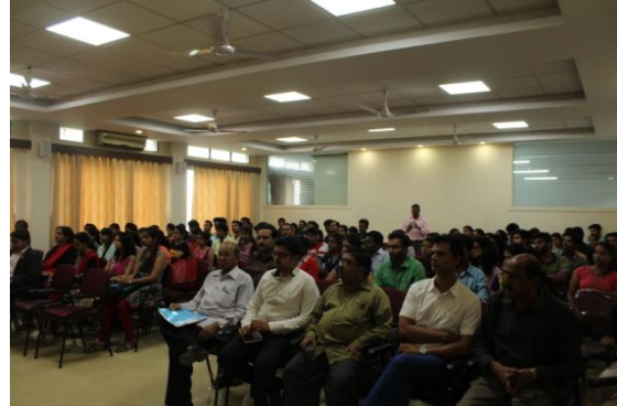
Seminar was attended by all the students and faculty members of the department