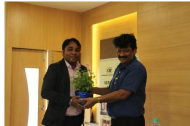
Felicitation of guests