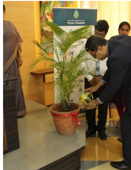
Inauguration of seminar by watering the plant